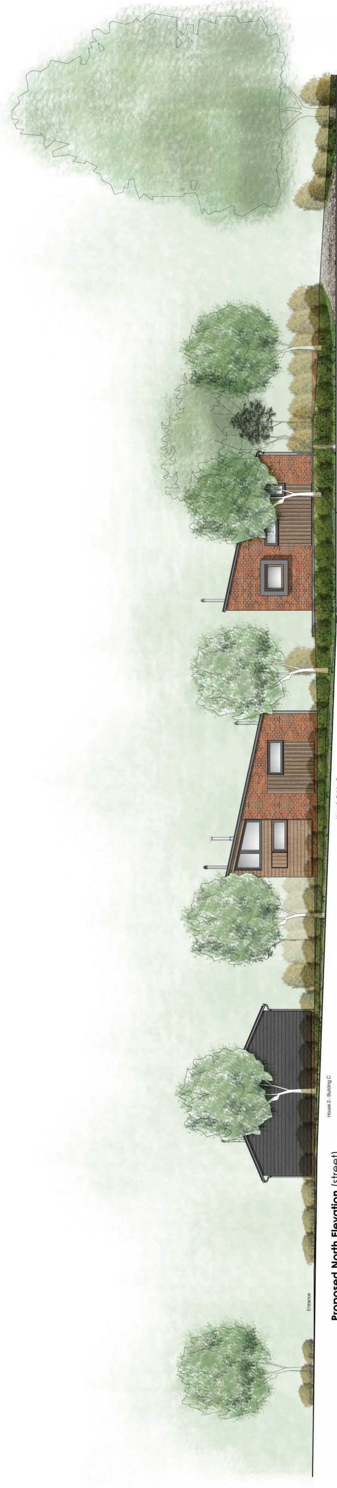
Proposed North Elevation (street) 1:100